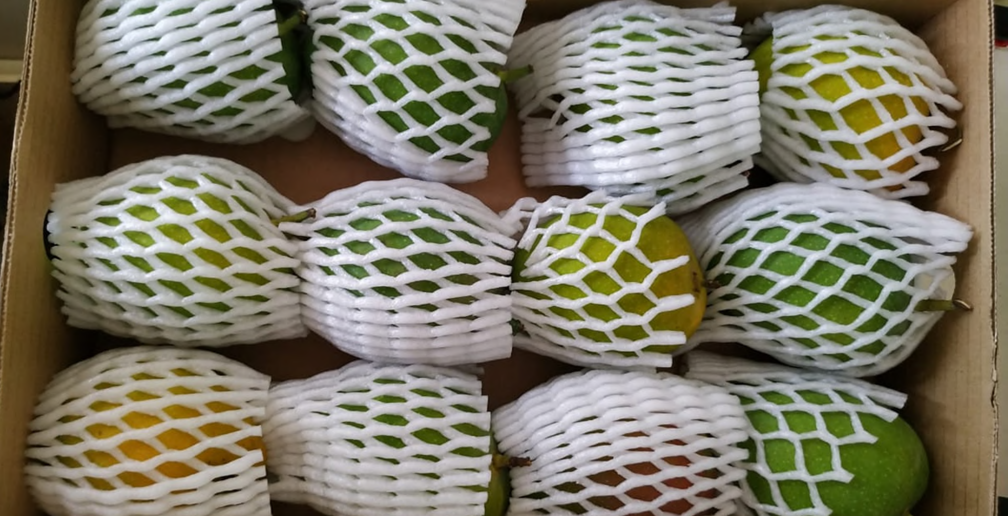
Mangoes individually packed in foam nets