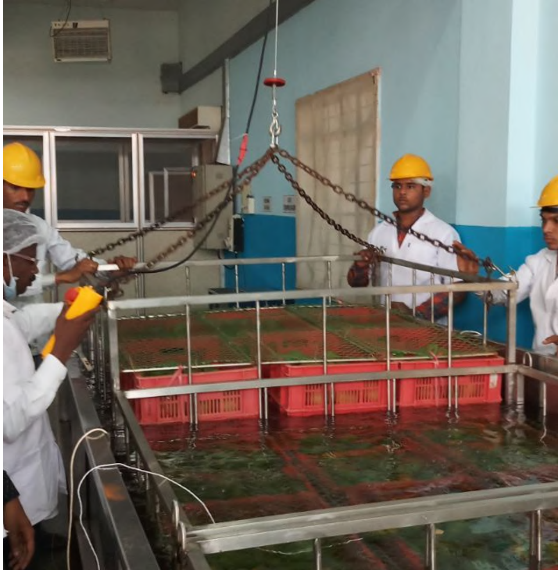
Hot Water Treatment being performed at Government certified facilities