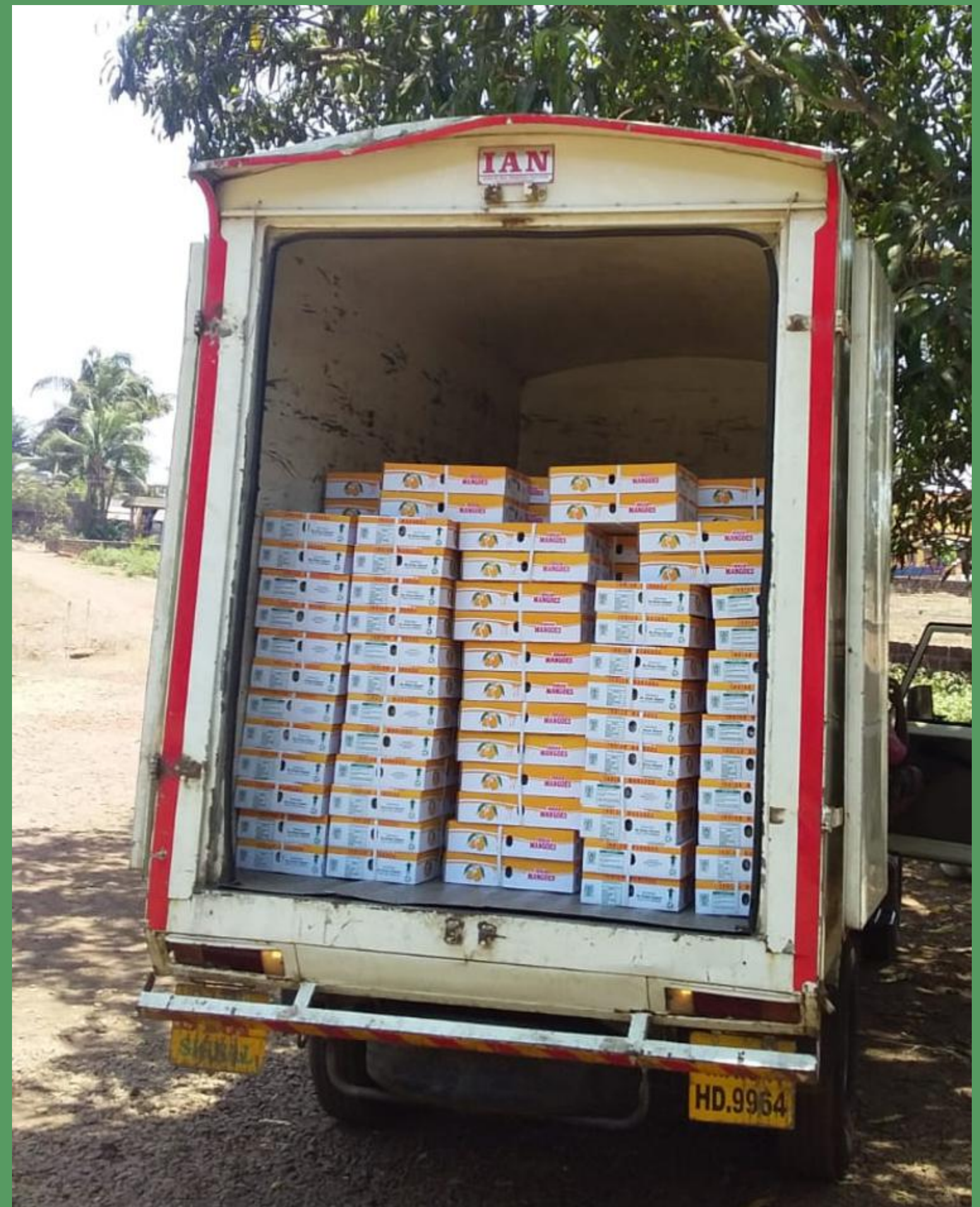
Mango boxes ready to be transported to the airport