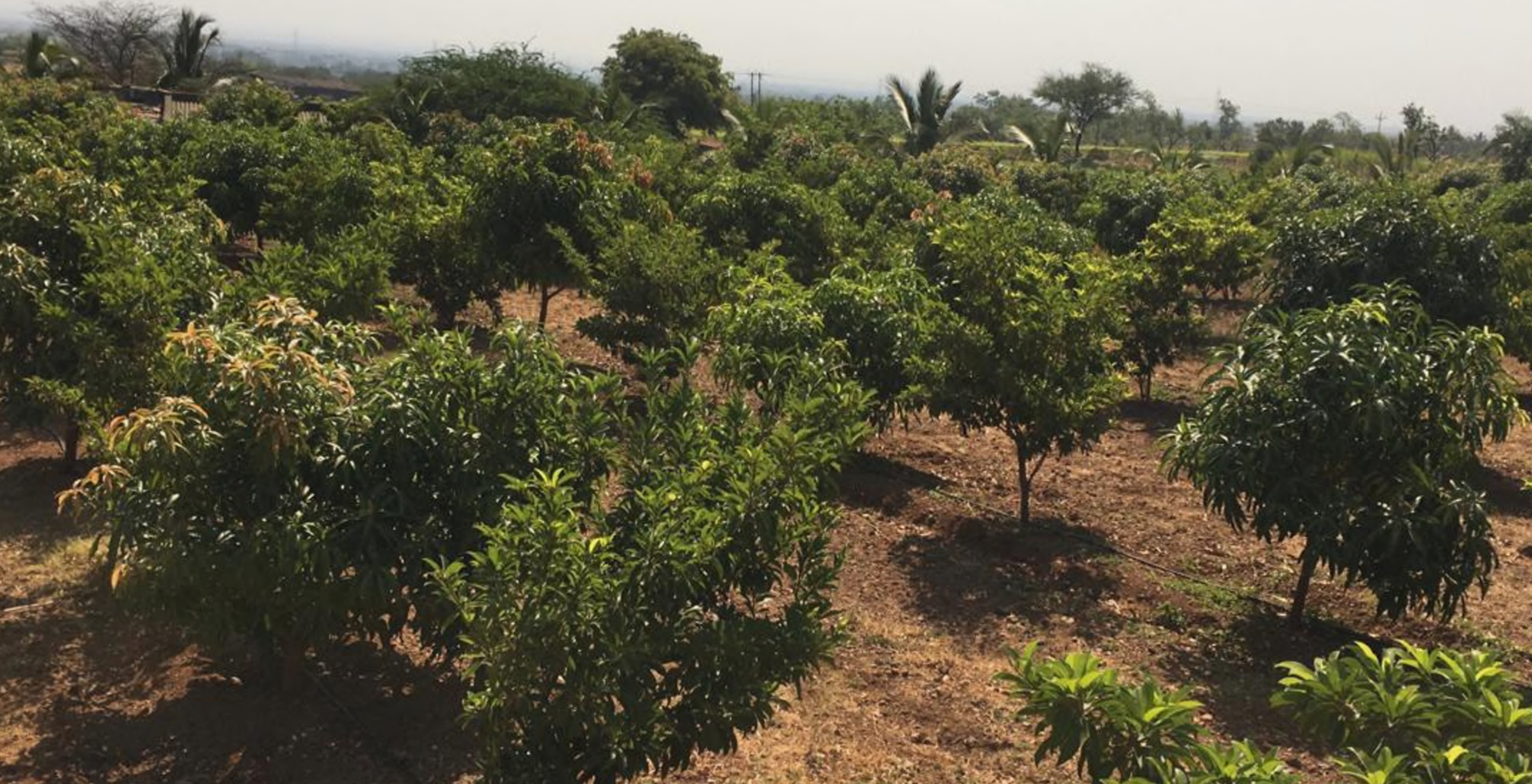
Mango Orchard owned by our cultivators